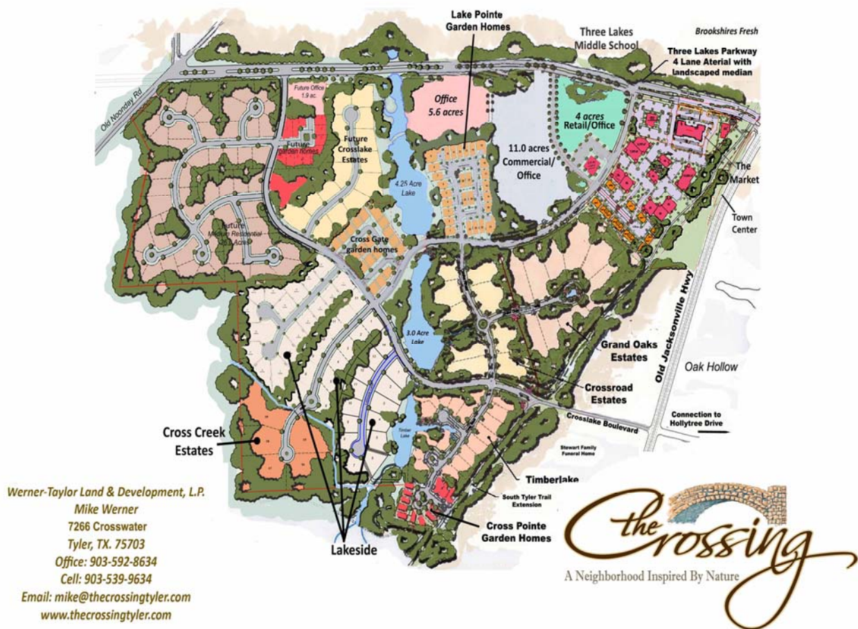
Figure 1 - Overall Master Plan

The Crossing is designed to optimize suburban needs by strategically intermingling small neighborhood retail centers with regional retailers and entertainment uses along Three Lakes Parkway with the residential developments within the interior of the property. Office uses are to be generally concentrated near the retail centers and alongside water features which will be seen throughout the development. The goal of this development is to successfully integrate a variety of land uses and densities to accommodate all the needs of the patrons and homeowners.