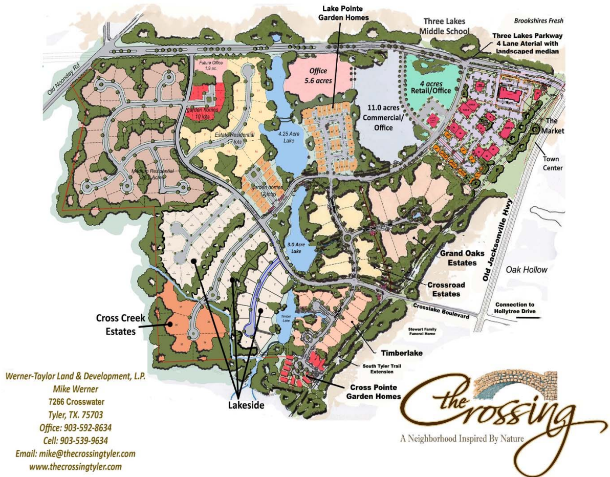
Figure 1 - Overall Master Plan

The Crossing is designed to optimize suburban needs by strategically intermingling small neighborhood retail centers with regional retailers and entertainment uses along Three Lakes Parkway with the residential developments within the interior of the property. Office uses are to be generally concentrated near the retail centers and alongside water features which will be seen throughout the development.. The goal of this development is to successfully integrate a variety of land uses and densities to accommodate all the needs of the patrons and homeowners.