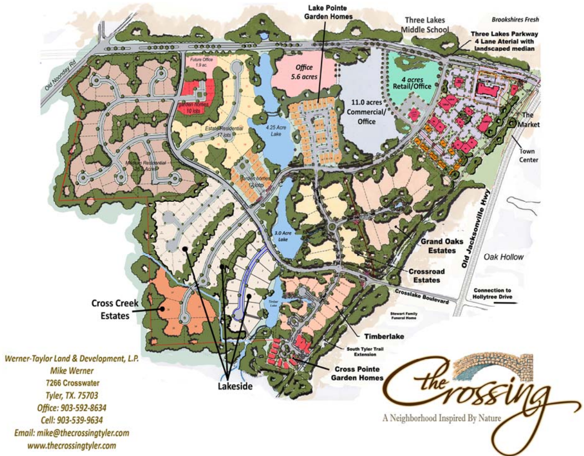
Figure 1 - Overall Master Plan

features which will be seen throughout the development.. The goal of The Crossing is to successfully integrate a variety of land uses and densities to accommodate all the needs of the patrons and homeowners.